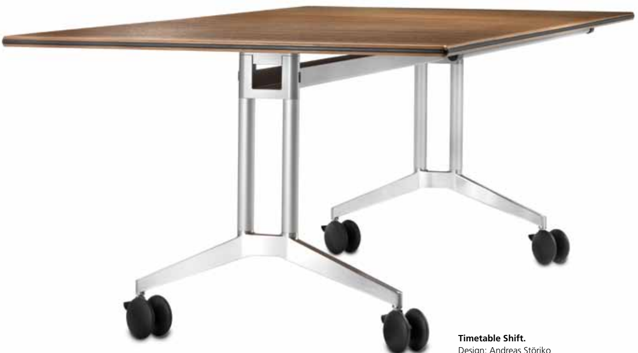
Timetable Shift. Design: Andreas Störiko

Timetable Shift combines Timetable's swivel-tabletop principle with the frame design of the established Logon conference table range. The signature uprights are topped out by a high-precision aluminium casting. Its dual function provides a stable bearer for larger tabletop sizes and a shoe for a spacious cable channel for connecting the table and multimedia equipment to the power supply. Substantial hinges allow wide surfaces to be safely tilted and an easy-to-use draw rod locks the tabletop horizontally or vertically. Specifiable in increments of five centimetres, formats of 150 to 210 centimetres in width and from 75 to 105 centimetres in depth are available to suit customer preferences. The applications are therefore limitless, from temporary work spaces, to tables for meetings or as conferencing systems. And what's more, Timetable Shift offers seamless solutions on demand by combining static Logon tables in suites that are sub-divided by folding partitions, extracting optimal performance from high-value communication-oriented space.