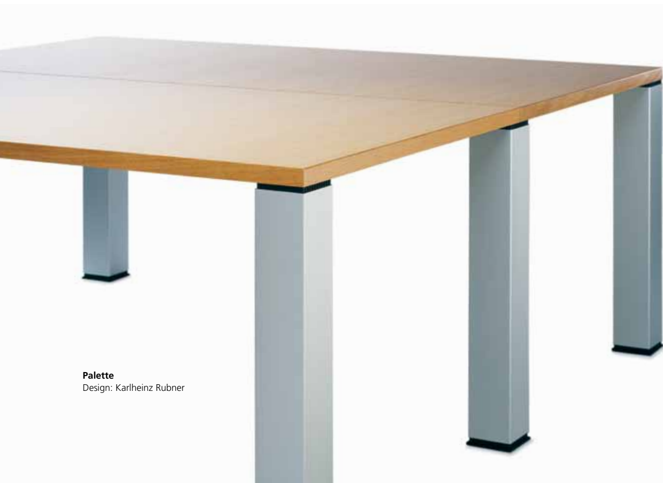
Palette Design: Karlheinz Rubner

The rigid blockboard tops do not require any underframes. This creates more legroom and allows space-saving stacking (like pallets) of any tabletops not currently needed. And what is more, in addition to mass-produced tabletops, the ingenious design allows customised tabletops – including integration of state-of-the-art multimedia equipment.